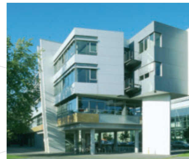
Wilhelm-Conrad-Röntgen Campus, BESSY building