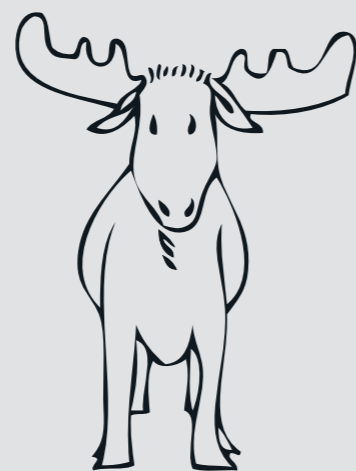
Swedes may be tired of looking at älg-pictures. A recommendation in this case could be to color it instead...