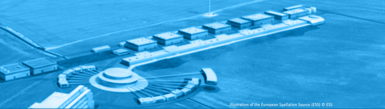
Illustration of the European Spallation Source (ESS) © ESS